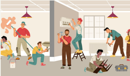
FRAME 7 - DUR: 17 SECONDS

The camera focuses on a group of people working as a team.