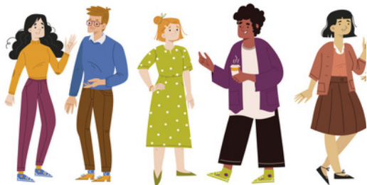
FRAME 4 - DUR: 17 SECONDS

The camera focuses on some characters in conversations as narration proceeds.