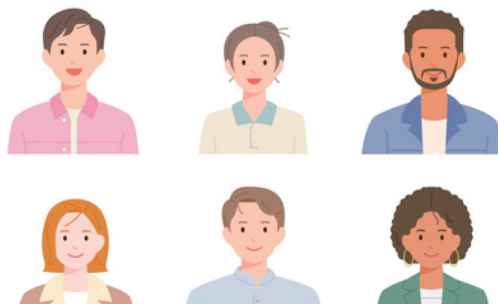
FRAME 14 - DUR: 17 SECONDS

The camera focuses on a man in a hurry, rushing through the crowd, avoiding eye contact.