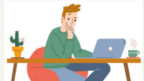
FRAME 9 - DUR: 17 SECONDS

Camera closes-up on a man in a critical thinking state trying to solve a problem.