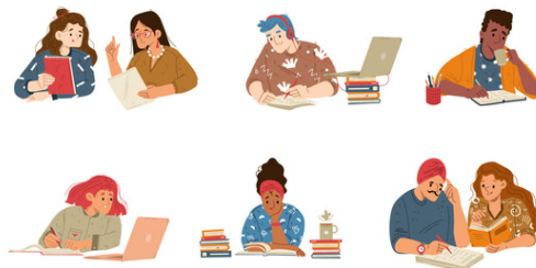
FRAME 5 - DUR: 17 SECONDS

The camera focuses on characters in learning situations as narration continues.