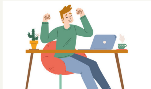
FRAME 8 - DUR: 17 SECONDS