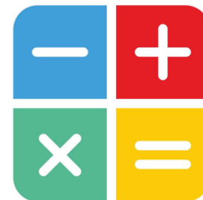
FRAME 15 - DUR: 17 SECONDS

The camera focuses on a man in a hurry, rushing through the crowd, avoiding eye contact.