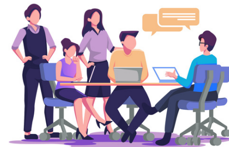
FRAME 6 - DUR: 17 SECONDS

The camera focuses on a meeting room with people having a conversation.