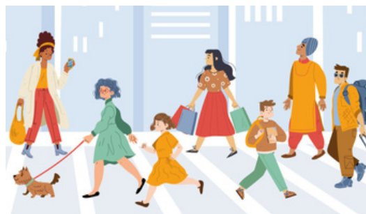
FRAME 17 - DUR: 17 SECONDS

Frame pans to show various people commuting to different places in a city setting.